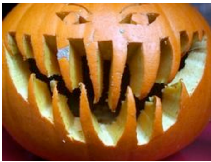
Halloween is a terrifying time for some

Many reported criminal damage to cars, homes and street lighting - with creepy costumes acting as the perfect criminal disguise.