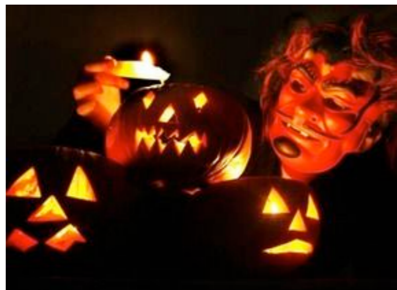
Halloween can be a scary time for homeowners